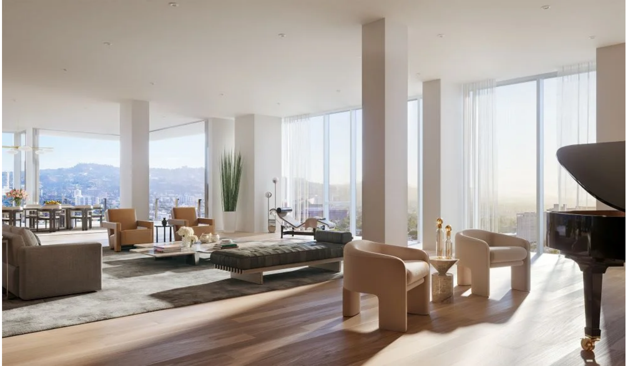
Floor-to-ceiling glass windows flood the interior with natural light

These glorious vistas continue inside, with dramatic floor-to-ceiling glass ushering in the golden sunlight Southern California is so internationally revered for. Inside differs from the outside offerings in the fact that the two floors are totally customizable to suit the needs and desires of the owners, with the number of bedrooms and bathrooms to be tailored upon request.