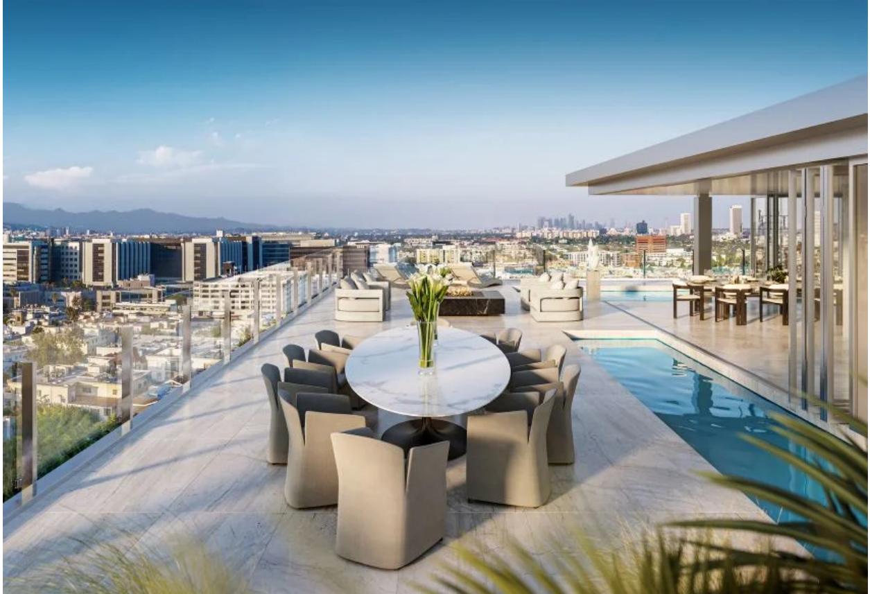
Perfect for hosting

Sprawling across the top two floors of the Four Seasons Private Residences LA , One LA comes in at nearly 13,000 sq ft of indoor space and boasts 6,000 sq ft of space on the outdoor roof deck, from which the panoramic views of one of the world's most iconic cities is almost unrivaled.